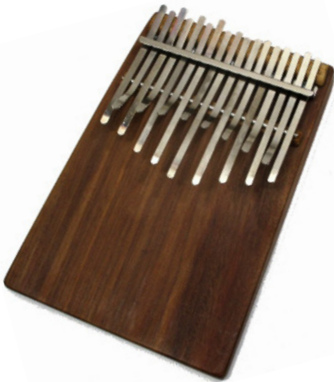
Celtic D Karimba

The low note, C#, is a half step above middle C on the piano.