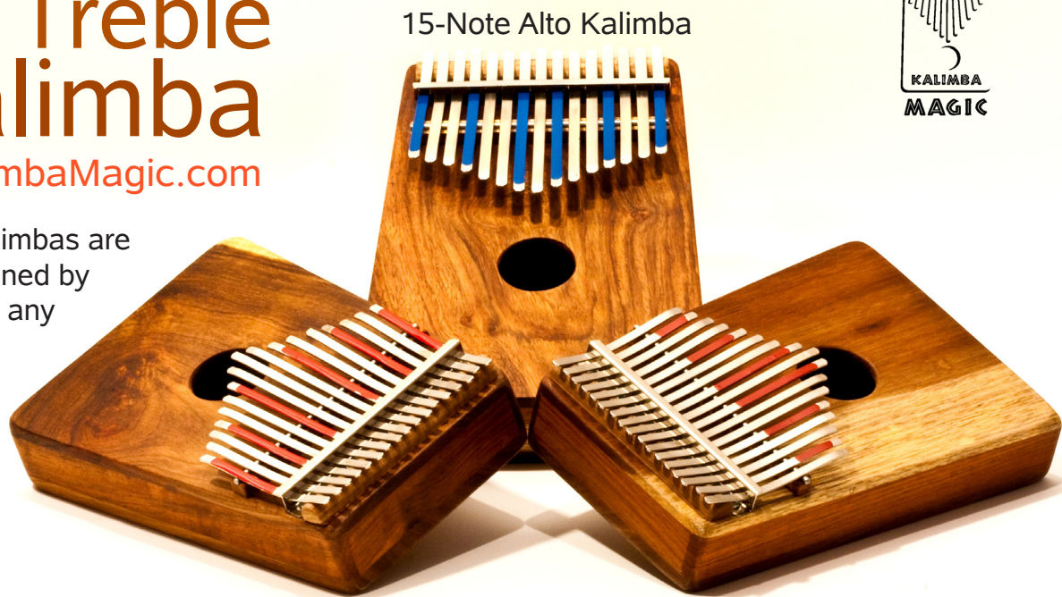
15-Note Alto Kalimba

Here's what you need to know about this new development in the kalimba world.